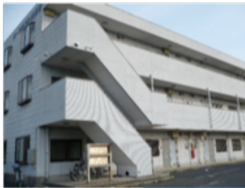
Male Dormitory (Atago Cho Parkland Sengendai)

Internet : Each room is able to connect to wireless internet access