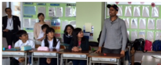
Exchange with Jr. High School Student in Choshi

Course consists of 40 unites (20 during Fall Semester and 20 during Spring Semester). Students are expected to enroll in all units. In order for students to successfully continue studying; required classes and examinations for which students are unable to obtain credit, will be offered again the following semester to be taken instead of elective classes. Annual events will be announced in Home Room (there is no credit or evaluation for HR)