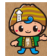
Geo Park Mascot "Geochi"