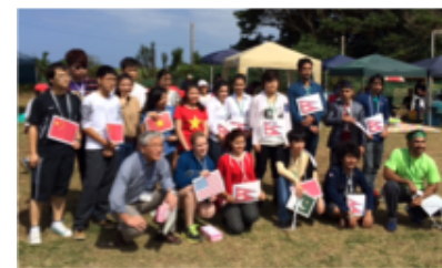
Participating at a local Choshi Elementary School Sports Day