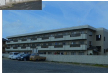
Female Dormitory (Kiokawa Cho Marie Claire)