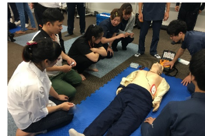
AED Paramedic training