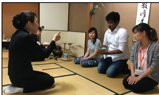
Japanese Tea Ceremony