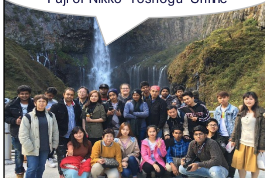
Excursions to Hakone • Mt. Fuji or Nikko • Toshogu Shrine